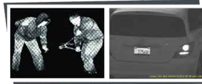
Thermal Camera Technology