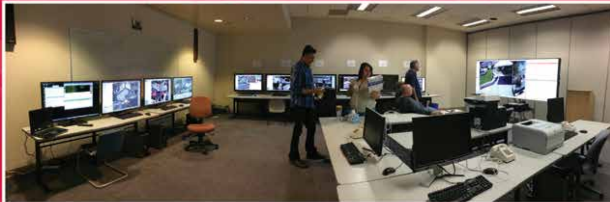
Command Center at the City of Hollister Police Department by SurveillanceGrid®